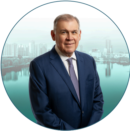
The Honorable Mel Martinez Former Senator JPMorgan Chase & Company

Junior Achievement's Hall of Fame showcases leaders who have made exceptional contributions to our region's economic development as a result of their commitment to business excellence. Honorees were celebrated at our most prestigious event of the year on November 13, 2024.